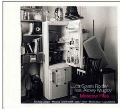
Moscow Files (Leo Records, 2017)