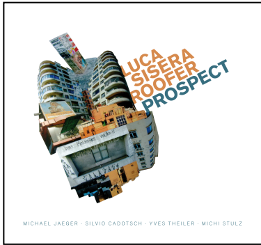
Prospect (Leo Records, 2015)